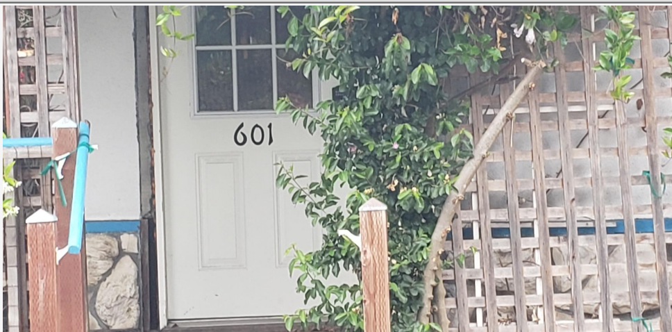
Subject Address Photo