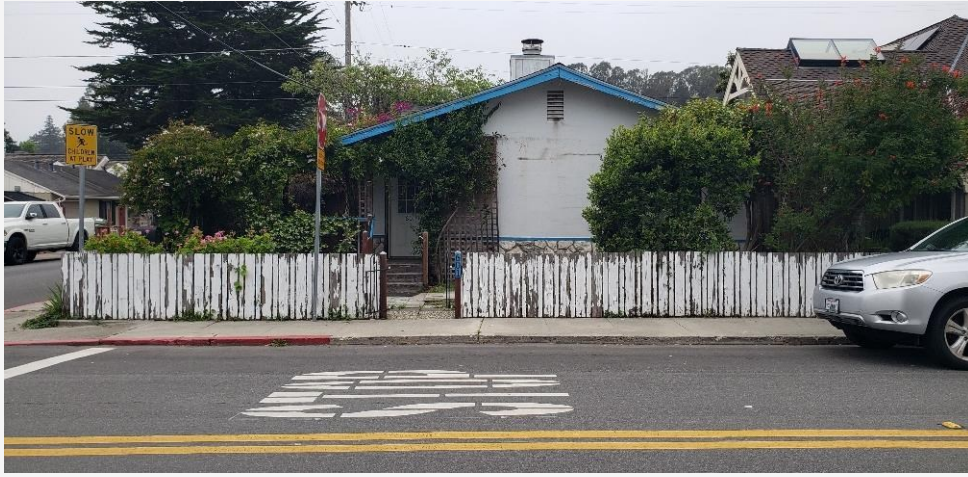
Subject Front Photo