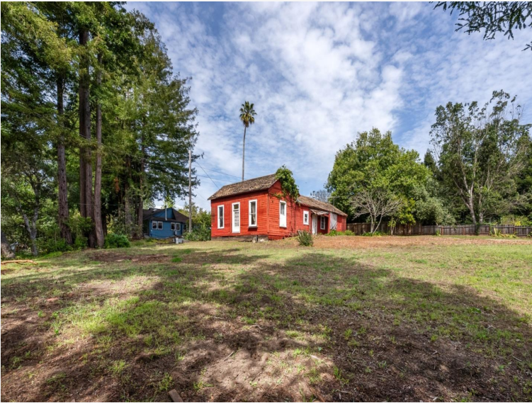
List 2 Photo