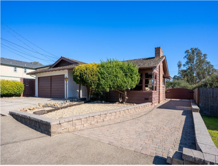
List 1 Photo