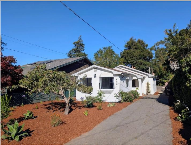
Sale 3 Photo