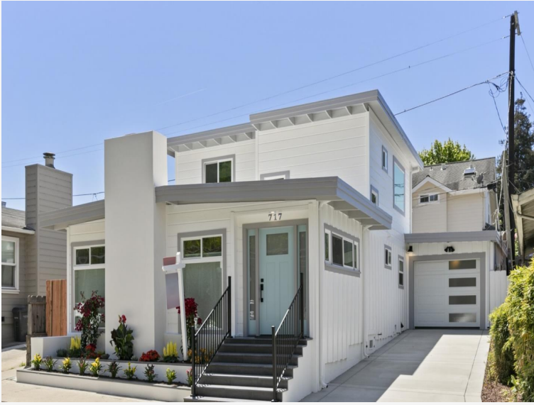
Sale 1 Photo