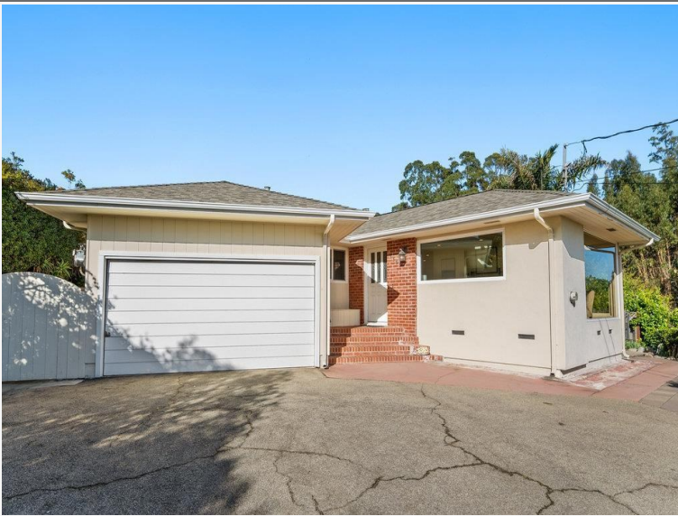
Sale 2 Photo