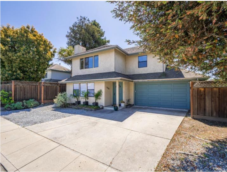
List 3 Photo