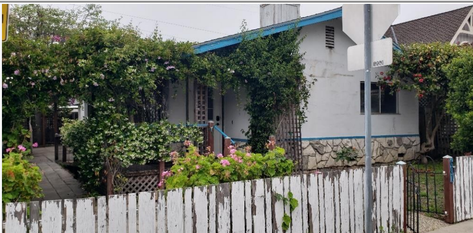
Subject Rear Photo