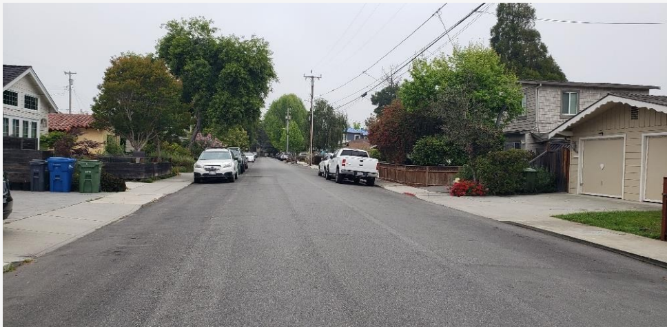
Subject Street Photo