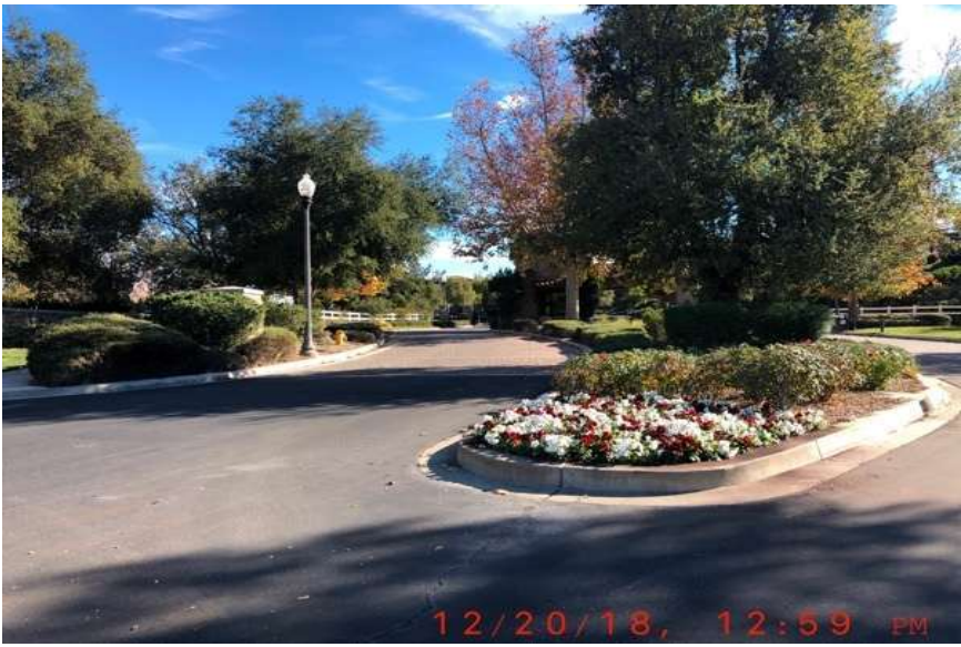
View across street