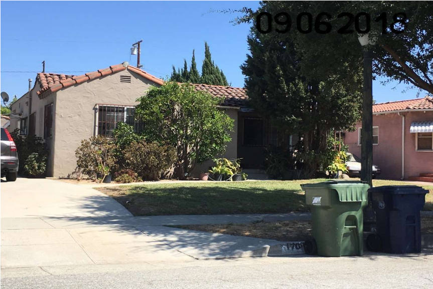
View across street