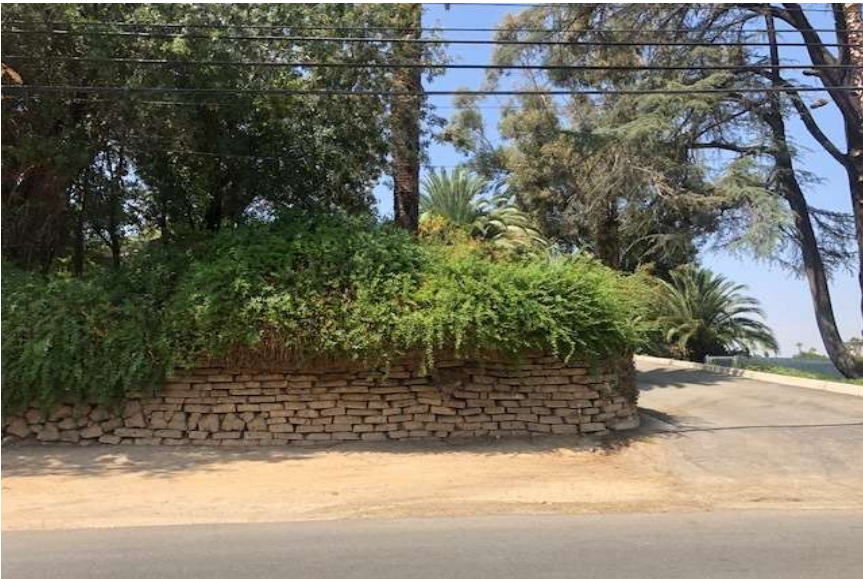
View across street