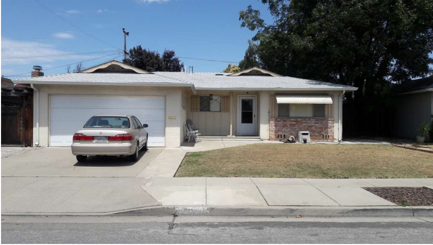
View across street