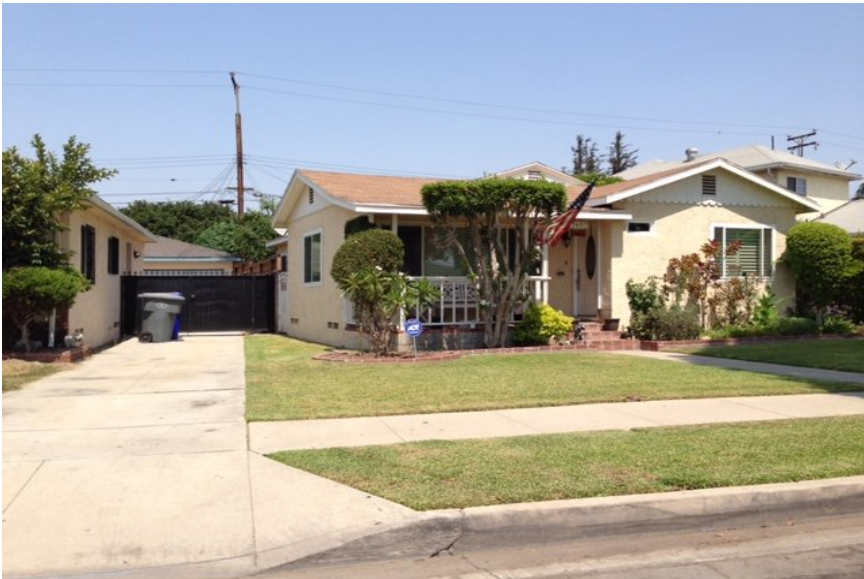
View across street