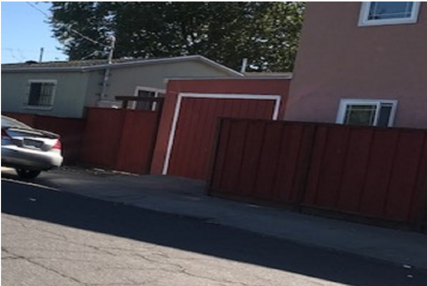
View across street