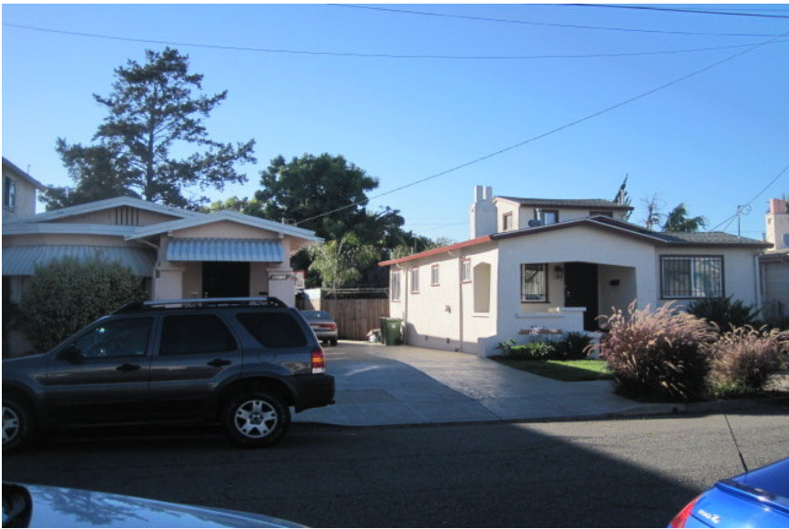
View across street